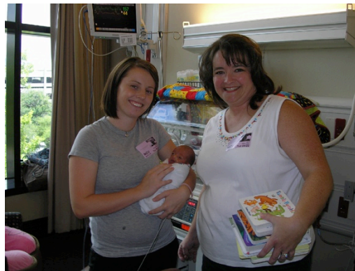
Mom and baby receiving a book, June 2010

Megan's Books for Babies is a 501(c)3 non-profit corporation founded to encourage early literacy in families, with a primary focus on families with babies in Neonatal Intensive Care Units (NICU). Families with babies in NICU face many challenges - among them, medical tests, surgeries, and therapies. The books given to NICU families through Megan's Books for Babies gives the parents a chance to relax and focus on their babies. The rhythms and patterns in books stimulate babies' brains and encourage learning. Learning begins at birth, so it is never too early to begin reading!